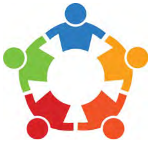
Community Overdose Action Team

In 2019 Public Health plans to offer even more options for diversity and inclusion training for all employees.